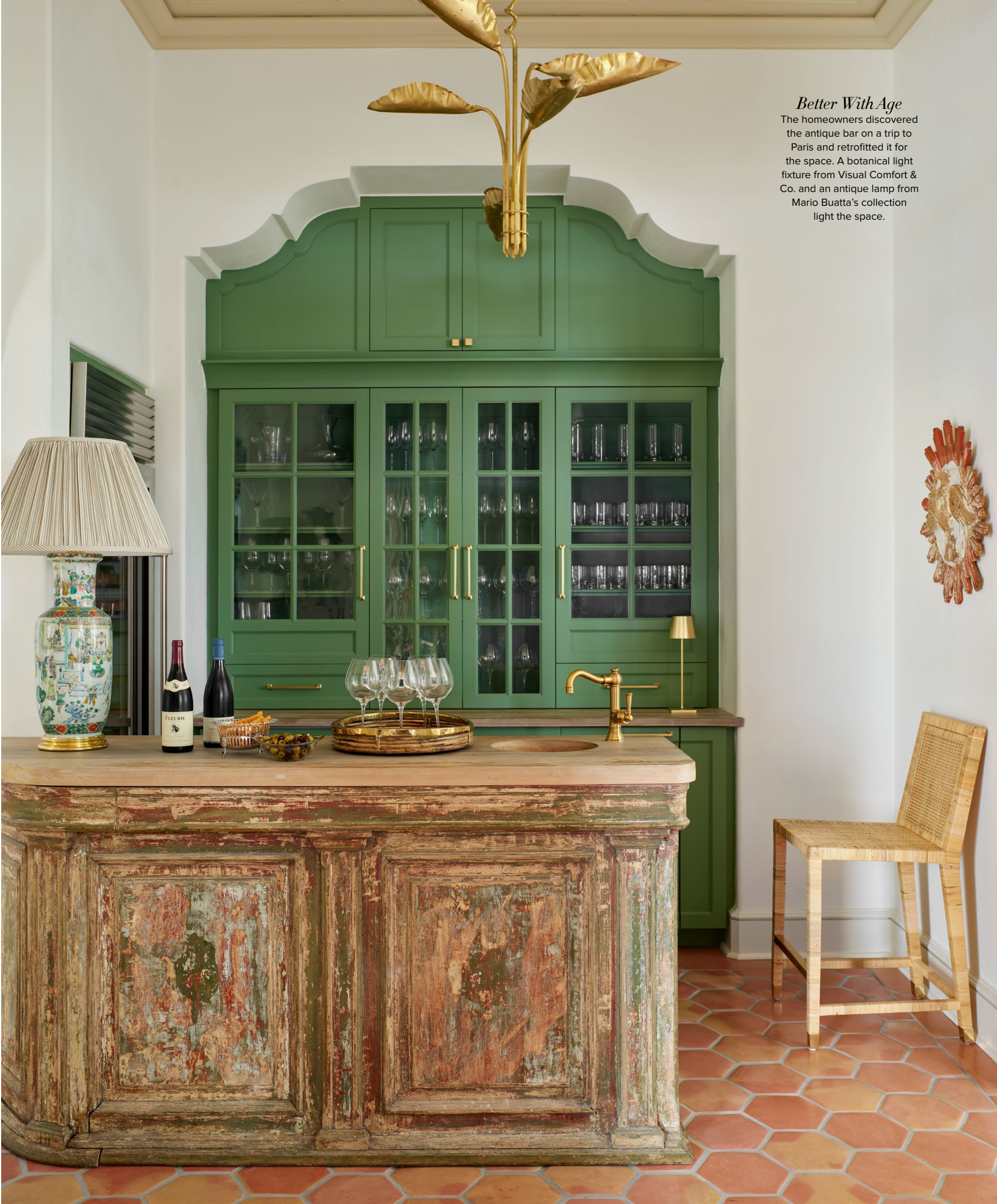
Better With Age The homeowners discovered the antique bar on a trip to Paris and retrofitted it for the space. A botanical light fixture from Visual Comfort & Co. and an antique lamp from Mario Buatta’s collection light the space.