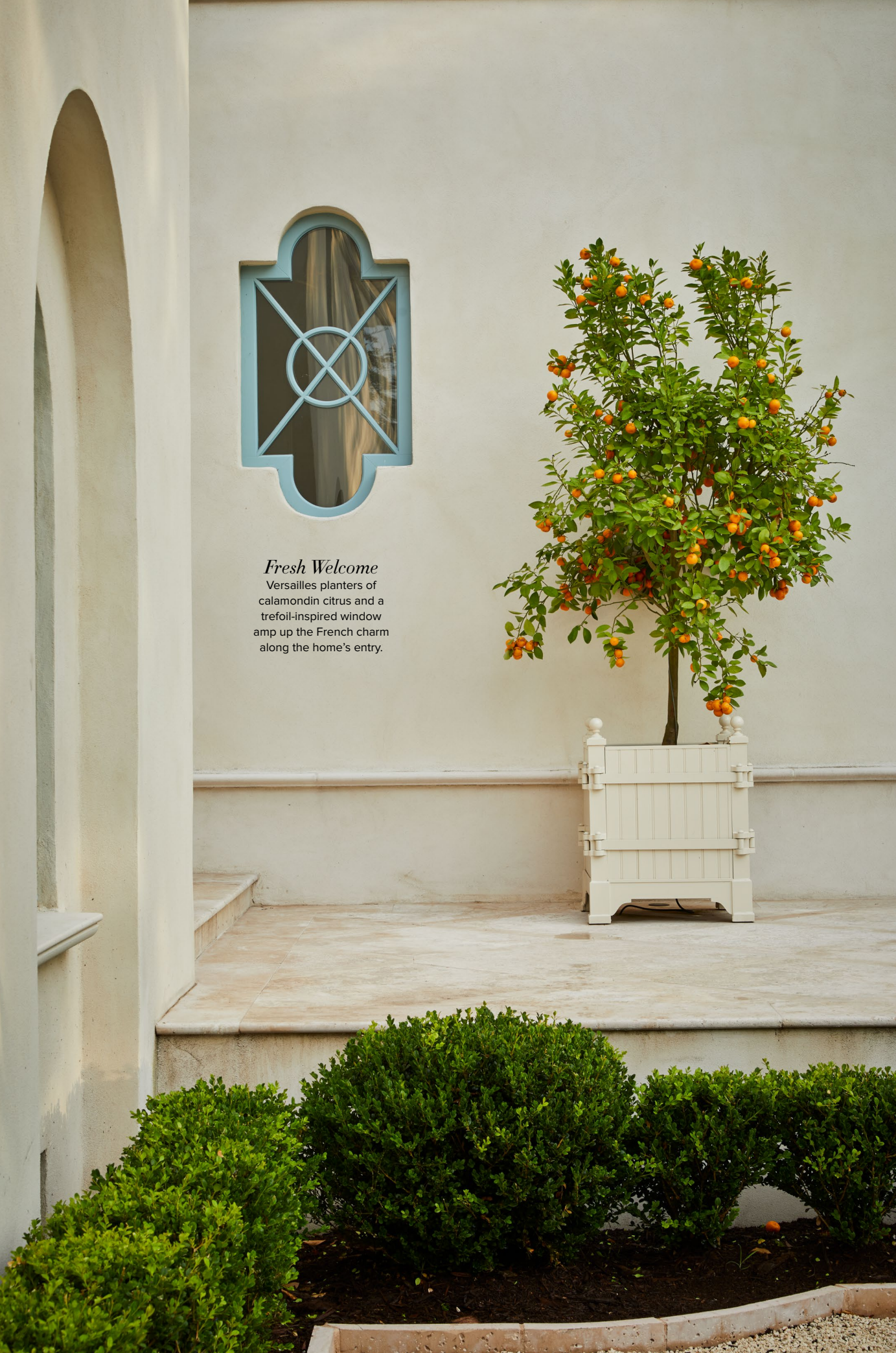
Fresh Welcome Versailles planters of calamondin citrus and a trefoil-inspired window amp up the French charm along the home's entry.