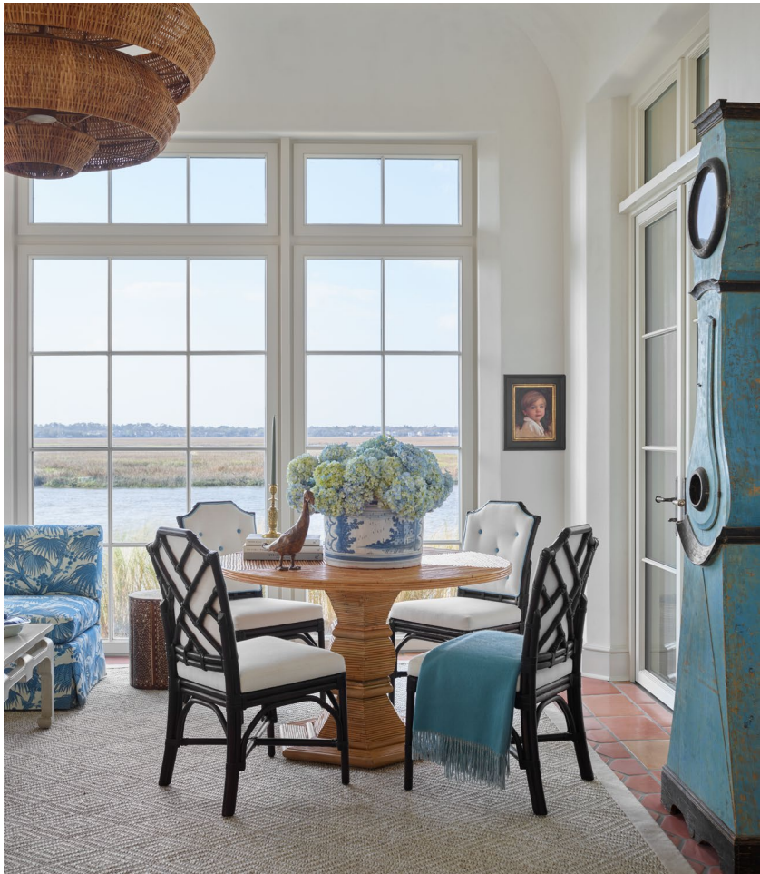
Sunny Disposition above Club chairs in Lee Jofa’s Oscar de la Renta Las Palmas fabric round out the cozy seating arrangement in the vast sunroom. right A Mecox pedestal table is just right for a game of cards by the water, while a blue antique clock stands sentry.