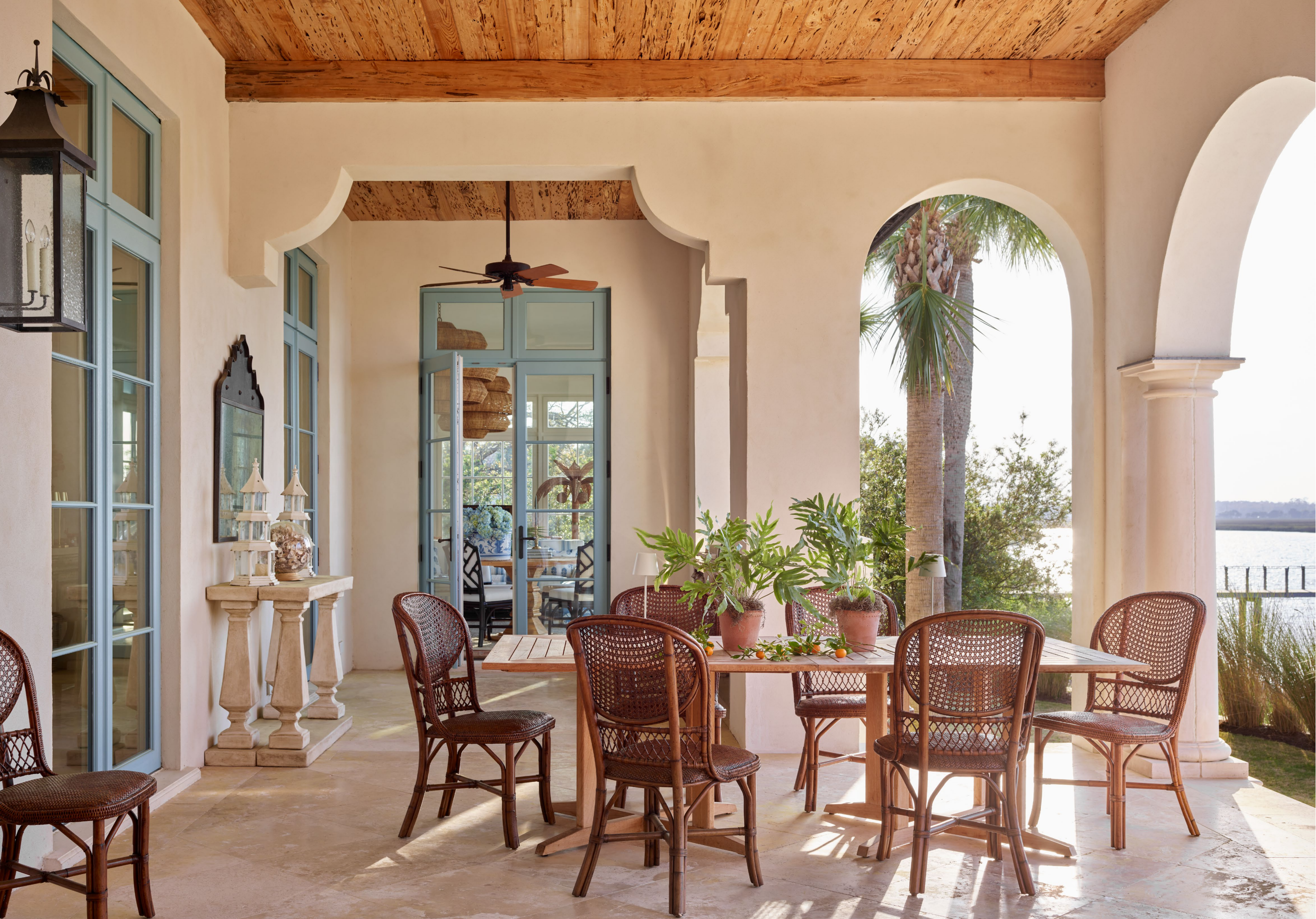
Al Fresco Dining Westminster Teak tables and cane-and-rattan Palecek chairs are ideal for entertaining. The pecky cypress ceiling channels the natural beauty of the Golden Isles.